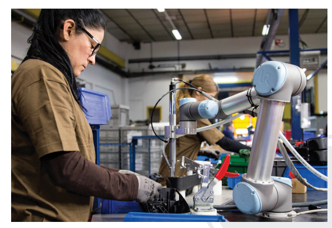
Collaborative robots work safely next to people.

HTE will conduct a free work cell acceleration review in your plant. Our focus is on maximizing your goals for productivity, flexibility, quality control, and safety.